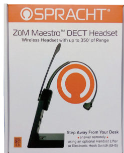
Retail Packaging - Monaural