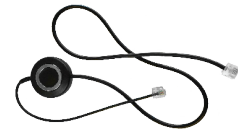
Electronic Handset Lifters and phone models: