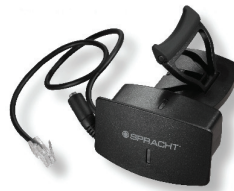
Remote Handset Lifter - RHL-2010