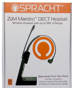
Retail Packaging - Monaural