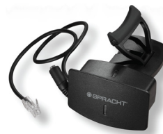
Remote Handset Lifter- RHL-2010